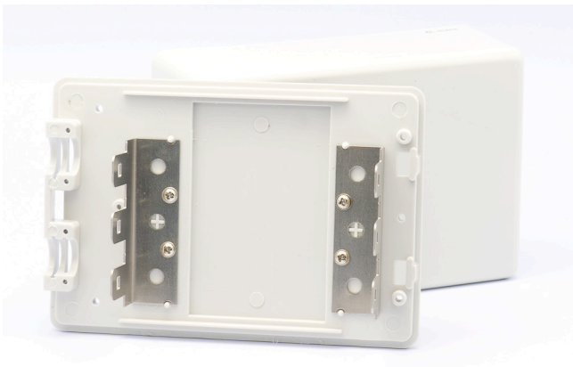
← 30pr backmount enclosure with removable lid

The AMDEX range of enclosures include 30, 50 and 100 pair. All of the enclosures come complete with a backmount frame fitted but are unloaded. A 30 and 50pr recessed is also available if wall flush mounting is required. The AMFIL 10pr disconnection module can be used with these frames.